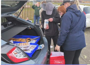
Steak-bakes at Skate-park

This has mainly entailed a trip up to the skate-park on Thursday evenings when staff hand out water, juice, crisps and a variety of Gregg's produce to around 20 young people and get a chance to catch up with what's happening in their lives.