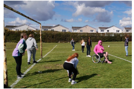
Fun & Games up the Moor

It is also hoped that we can help out with OneCAN's project to create an outdoor community garden at the High Mill site.